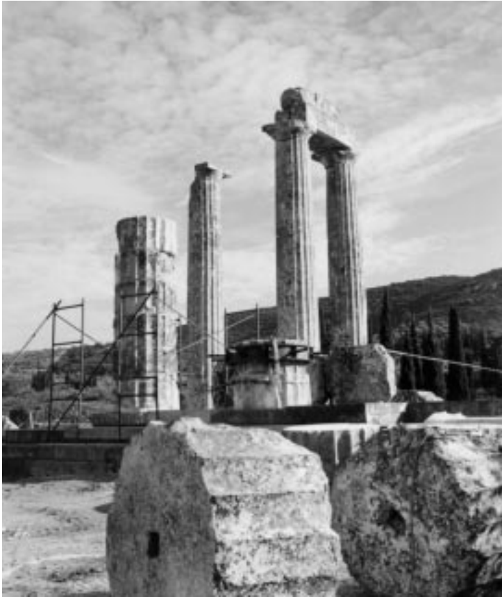
Fig. 16. Two “new” columns going back in place (six drums set on one, two on other, of total 13 in each) on November 29, 1999.