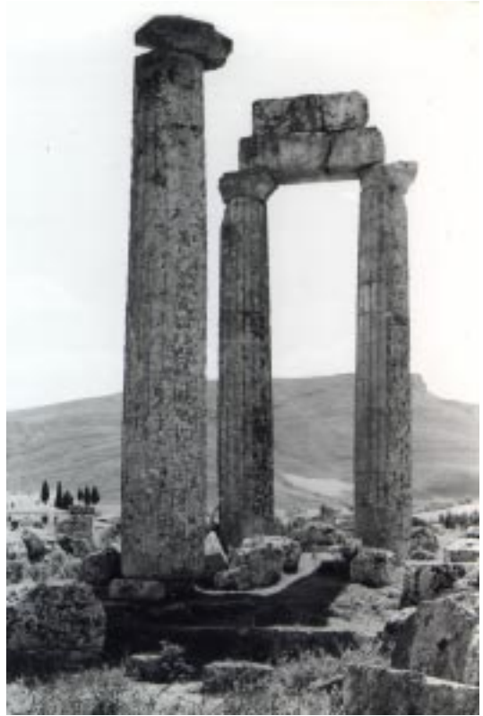
Fig. 11. Photograph of the Temple of Nemean Zeus in 1908, from the east, by Boissonnas.

What did the ancient Greeks know about civil engineering that allowed them to build such an earthquake-resistant structure? It hardly need be said after the fatal earthquakes of August and September, 1999, in Turkey and in Greece, respectively, that Nemea lies in a very active earthquake zone. Although my friends in the engineering department will probably tremble at my way of expressing it, I think they will agree that the Greeks had discovered the principle of flexibility in their construction. Thus, in the earliest years of Greek temple building, the columns were monolithic; the Temple of Apollo at Corinth of about 540 B.C. will serve as the example nearest to Nemea. By the time the Temple of Nemean Zeus was constructed 200 years later, columns were made up of individual drums—13 in each column at Nemea 11 —that could absorb the shock of earthquakes. The drums might slip and “dance,” but the effect of whiplash in a rigid monolithic column was minimized by the flexibility that the horizontal joints of the column allowed. Although I await a graduate student to carry out in a dissertation the necessary detailed analysis of the ancient texts and monuments