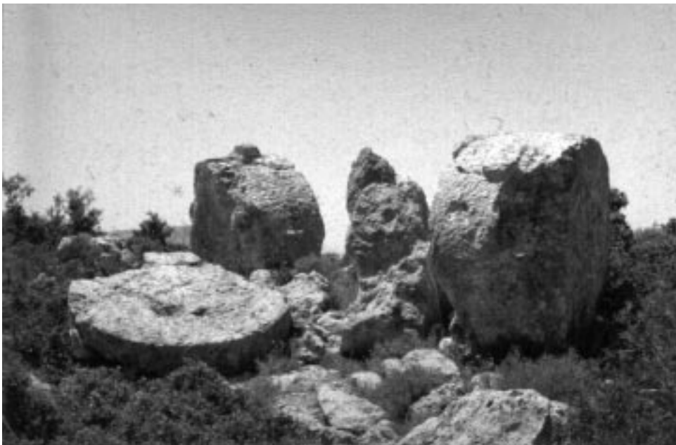
Fig. 13. Rough worked column drums still in the quarries.

The stone of the Temple of Nemean Zeus came from quarries lying 3 kilometers to the east where roughly worked column drums—prepared but never moved to the temple or used (Fig. 13)—still lie. The stone is a sandy limestone with pockets of “rotten” stone or even earth interspersed with areas of very hard stone. This is the stone which we must cut and use to replace the blocks robbed out of the base of the temple centuries ago.