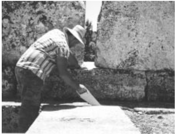
Fig. 14. Sawing a joint.

order to create precisely conforming surfaces—if the saw went a little more deeply into the surface of one block, it automatically left a corresponding convex bulge in the surface of the adjoining block (Fig. 14). The surfaces were not necessarily perfectly straight, but they were perfectly parallel. Not only did this use of the saw solve our problems, but it forced us to look at ancient joint surfaces where we discovered that there are still clear traces of saw marks from antiquity (Fig. 15). The local workmen were proud that they had discovered one of the secrets of their ancestors, and became convinced