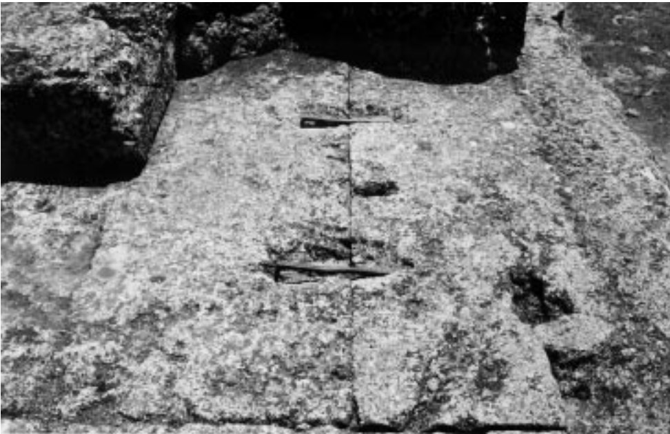
Fig. 12. Two ancient iron clamps partially pulled from their blocks.