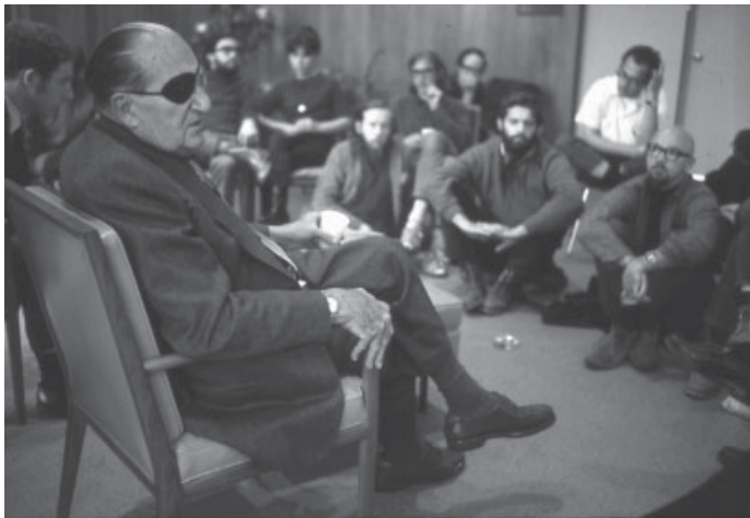
Fritz Lang at UC Berkeley, November 1968.