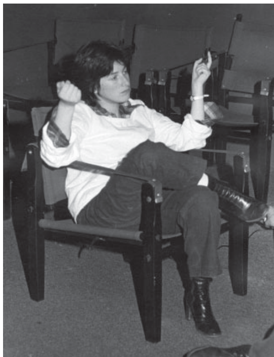
Chantal Akerman at the Pacific Film Archive, December 1, 1976.

PFA's librarian and curators of avant-garde film and video have all taught university courses, some for several years. In addition, students can gain experience as interns in the library and as student curators for the avant-garde program. Curatorial interns organize annual programs that feature the work of student filmmakers. (The Women of Color Film Festival is also a student initiative.) Often in collaboration with the Consortium for the Arts at UC Berkeley, PFA sponsors artists' residencies, which bring filmmakers for screenings and meetings with students for periods of one day to two weeks. This is a more formalized version of Godard's 1969 visit, but inspired by the same notion of bringing together artists, audiences, and students. The yearly "How to Read a Film" workshops give high school teachers the background and the tools to bring cinema and media awareness into their curricula.