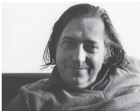
Henri Langlois. Date of photograph unknown.